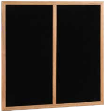
Boxer Infrared Panels